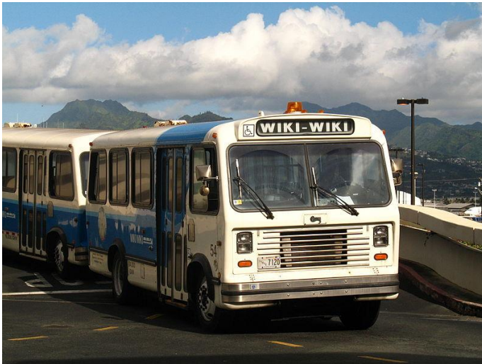
Wiki-Wiki Shuttle at Honolulu International Airport